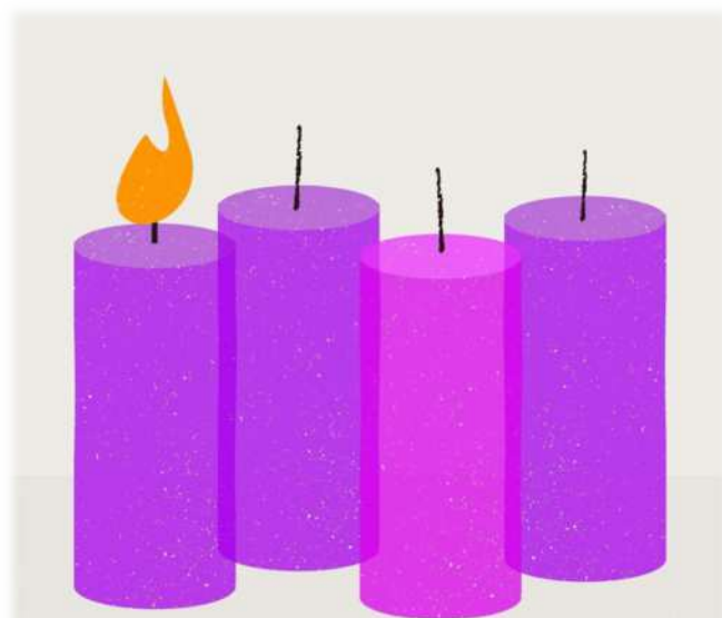
The First Sunday of Advent

Rectory Fax 516-354-7450 School Office 516-352-4466 Faith Formation Office 516-352-0510 Parish Outreach Office 516-352-5400